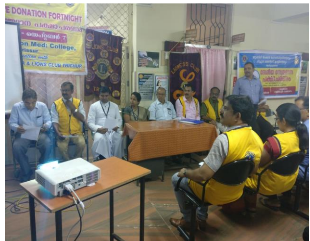
Figure 1: Eye donation awareness program conducted by our hospital in association with Lions club.

Authors utilized the help of local voluntary, social, and religious organizations for the implementation of the programme. The team consist of a project coordinator, corneal surgeons of our hospital, social worker, publication officer, technicians and projector, video, photography and driver of eye bank vehicle. The help of social, religious and voluntary organizations was used for selection of sites, local publicity, arrangement and mobilization of people and other infrastructure. Schools, colleges, clubs, organizations, trade union offices, public functions, etc. were utilized for the arrangement of this awareness and motivation camps. Newspaper, all India radio, doordarsan, public announcements, notices etc. were used for giving publicity regarding the programs. The program included seminars, study classes, discussions, symposium, question and answer section, lectures and utilized slides, video, films and distributed booklets, posters, eye donation forms etc. Figure 1 shows an awareness program conducted by our hospital.