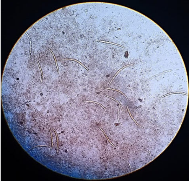
Fig. 2. Stool microscopy showing rhabditiform larvae of S. stercoralis , which were motile at the time of stool collection. Image taken at 100× magnification.

Clostridium difficile toxin (VIDAS difficile toxin A and B, bioMérieux SA) were negative.